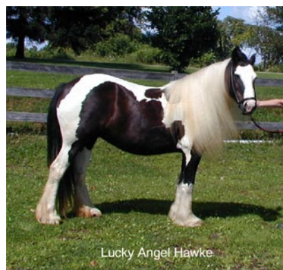
Lucky Angel Hawke