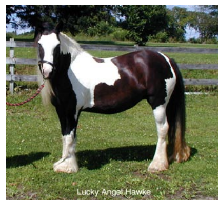
Lucky Angel Hawke