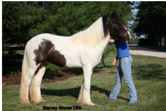
Blarney Stone's Ditto

* DNA-VP INDICATES PARENTAGE HAS BEEN CONFIRMED THROUGH DNA TESTING